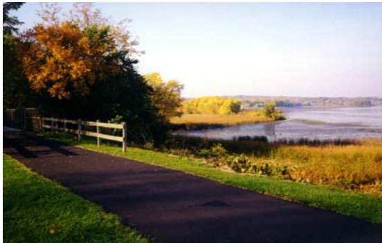
View along the trail in the Town of Colonie

The Friends of the Mohawk-Hudson Bike-Hike Trail will work to ensure the long-term success of the Mohawk-Hudson Trail and related trails. This includes integrating the Mohawk-Hudson Bike-Hike Trail as a keystone forging a link among three major state trail corridors: the Erie Canalway Trail, the Hudson River Valley Greenway Trail System, and the Champlain Canalway Trail. When completed, the Canalway Trail will span over 500 miles and connect numerous cities, towns, and villages along the Canal System, making it one of the longest multi-use recreational trails in the country.