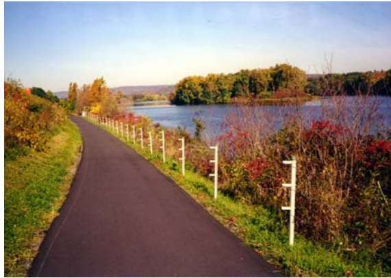
Trail along Mohawk River near Lock 8

The Mohawk-Hudson Bike-Hike Trail is a multi-use trail located along the Mohawk and Hudson Rivers in Albany and Schenectady Counties. The Mohawk-Hudson Bikeway parallels the Mohawk River from Rotterdam Junction to Cohoes where the Mohawk and Hudson Rivers converge. Then, an on-road section leads you to another trail along the Hudson River ending in Albany at the Corning Preserve.